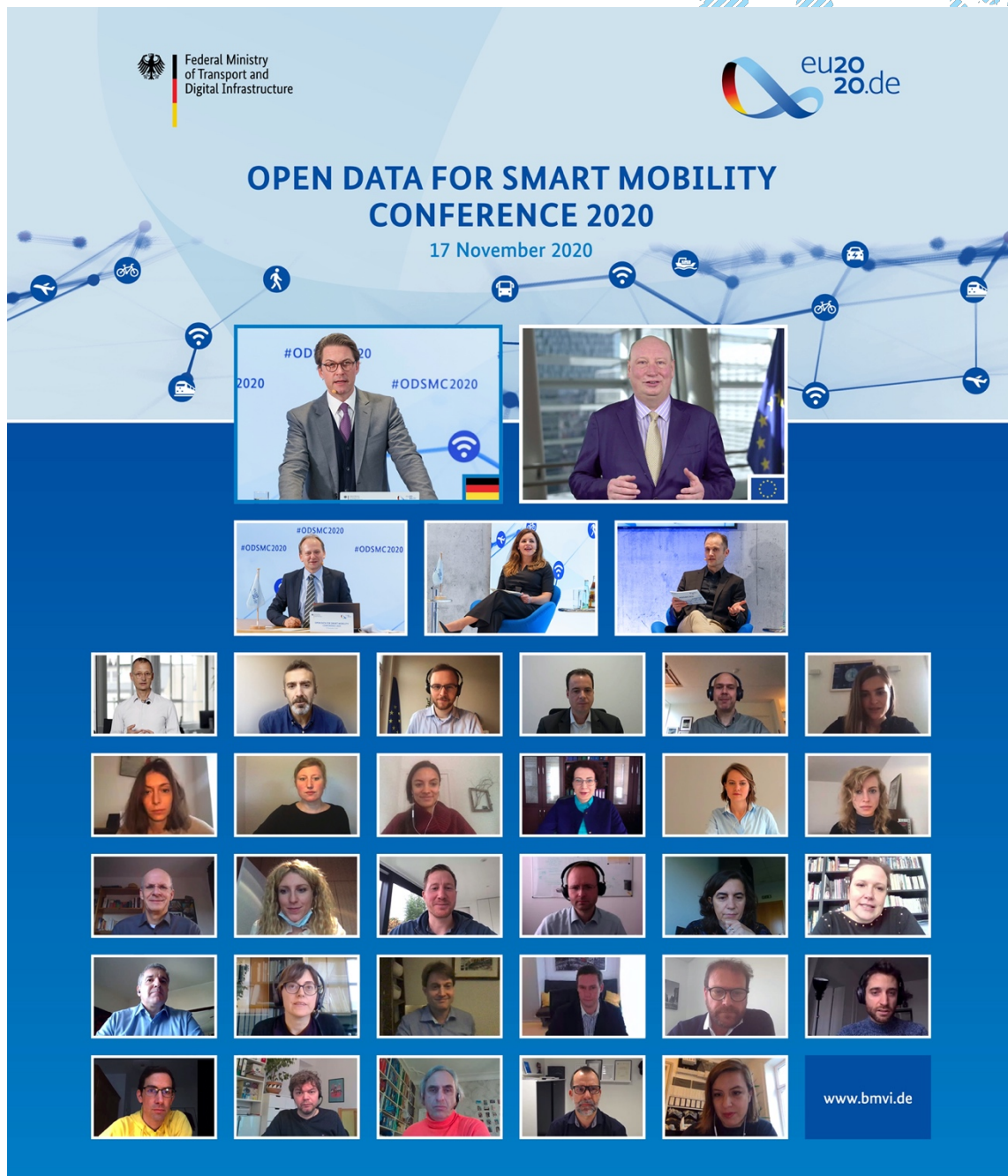
Moderation and speakers at the ODSMC 2020.