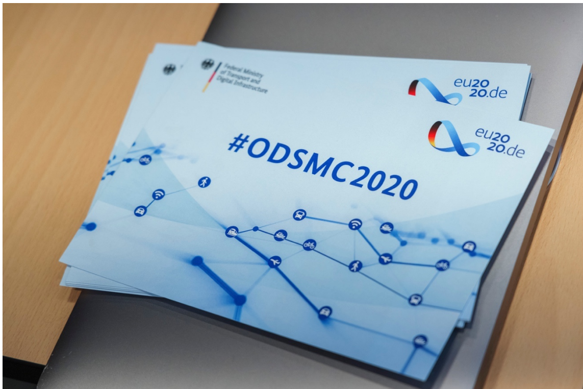
Moderation cards of the ODSMC 2020 (BMVI/Deckbar 2020).