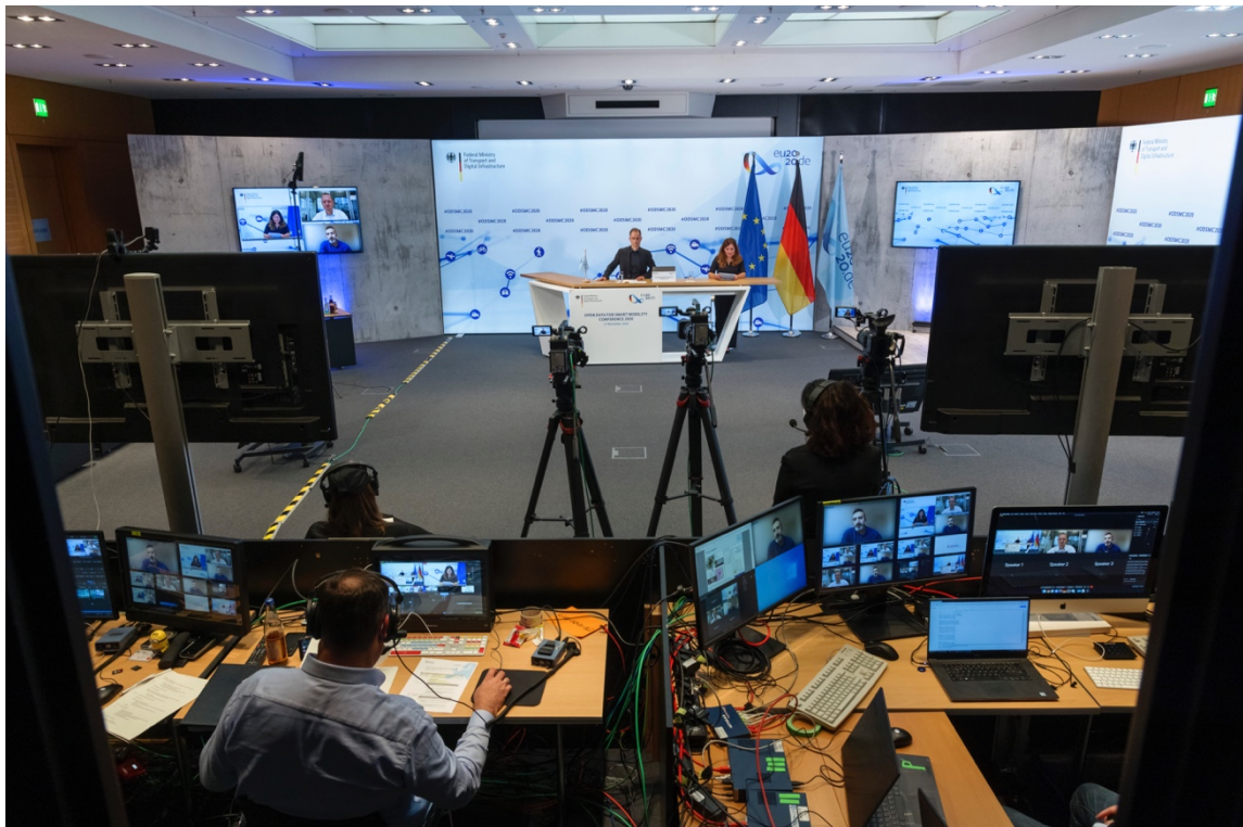
The view from behind the scenes into the studio.