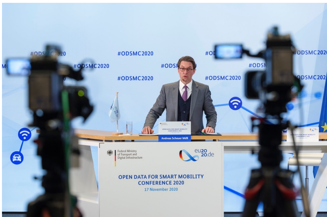
Federal Minister of Transport and Digital Infrastructure Andreas Scheuer at the ODSMC 2020

According to Scheuer, the Ministry of Transport and Digital Infrastructure is the ministry with the largest store of data in Germany. The data is provided via the mCLOUD, a central access point for all openly available data relating to the ministry's subject areas, which include road, rail and air traffic, space travel, climate and weather, and waterways. The mCLOUD offers developers in companies, research institutions and public entities direct access to data. This helps to promote the development of innovative ideas in the field of mobility. One of the ministry's most important projects is the establishment of a national mobility data space, intended to serve as the basis